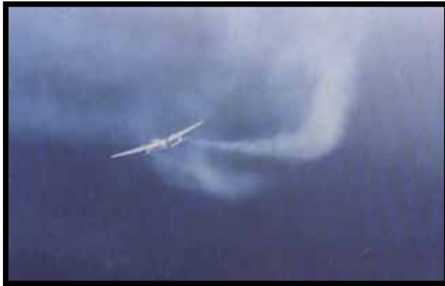
Figure 1. Aircraft dispensing hygroscopic seeding material, resulting in a visible trail of water droplets.

The long-term commitment and leadership of the funding organizations in South Africa played a major role in the progress made, providing a stable working environment in which innovation and a multidisciplinary team effort could thrive.